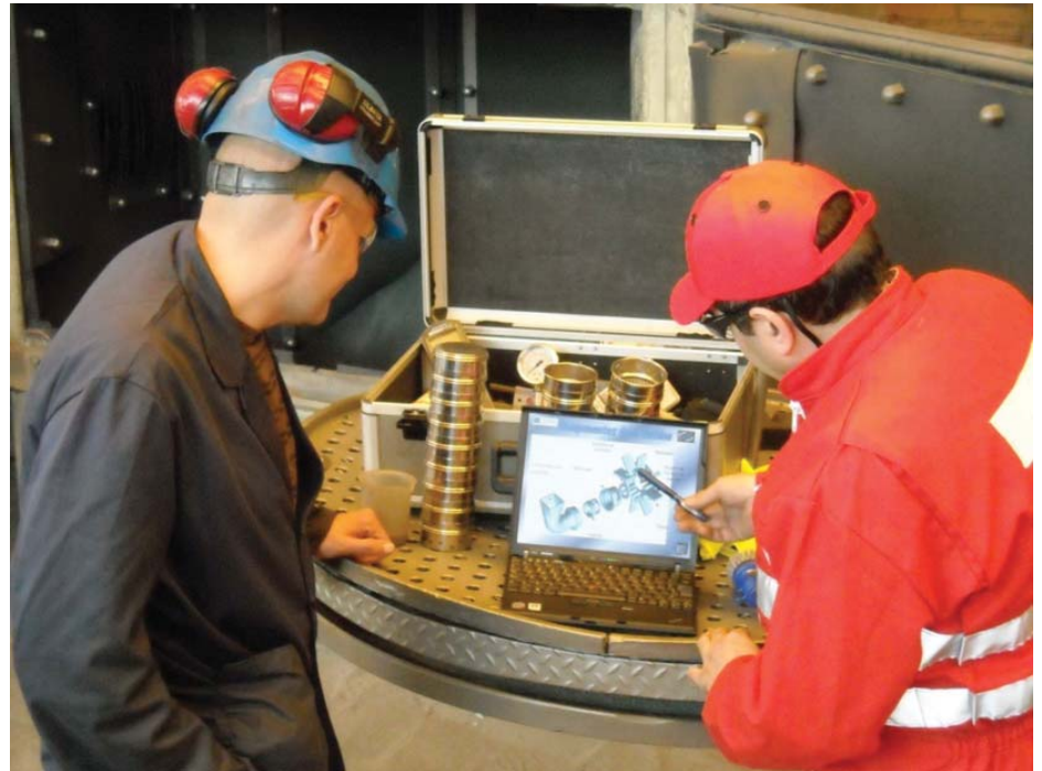
Technical assistance: WAlUE (WA Leading Unit for Expertise).

the marine industry around the world and is documented to perform well above expected levels in terms of blast efficiency, surface roughness and paint consumption.